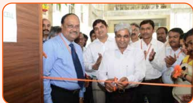
Honorable Chancellor inaugurating Alumni Cell

REVA Alumni Association is dedicated to bring together the alumni community on a common platform to build an appropriate channel of personal and professional support to all through 'self-help' within the community.